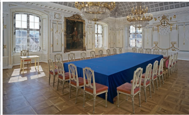
👑 🏰 Site of important decisions: The last General Chapters of the Mergentheim era were held in the chapter house

on the edifice. The last major construction work of the Teutonic Order took place between 1780 and 1782, with the erection of the elegant Classical chapter house designed by Franz Anton Bagnato.