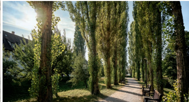
👑 🏰 A towering avenue of poplars runs between palace and park

To this day, the importance and power of the Teutonic Order in the Christian realm can still be seen in the rooms of the palace. The lives and work of a religious order is not the only aspect on display in this 3,000 m 2 space. The museum showcases the town's history and features the Adelsheim's antiquities collection, the dollhouse collection, the Mörike cabinet, an exhibition on the Neolithic Age in the Tauber Valley with a touching family burial plot, and an array of temporary exhibits. Always worth a visit!