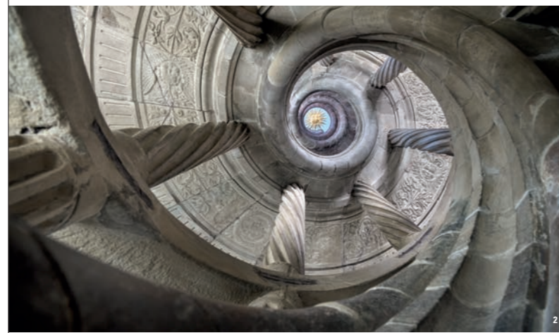
👑 🏰 Climbing the Berwart spiral staircase offers unique perspectives