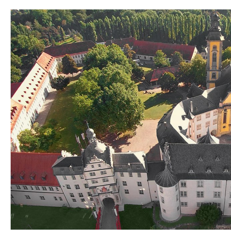
The impressive residential palace is situated in the idyllic Tauber Valley